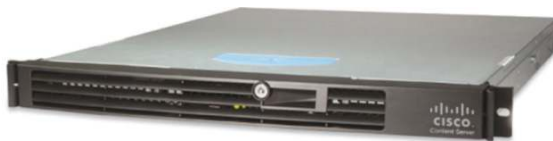
Figure 2. Cisco TelePresence Content Server

With the Cisco TelePresence ® Content Server (Content Server), your organization can share knowledge and enhance communication by recording video conferences. You can access live and on-demand presentations, distance education classes, and corporate training sessions - anywhere, anytime. In addition, you can distribute live or recorded content to any computer, download to your favorite portable media device, or share through iTunes U (Figures 1 and 2).